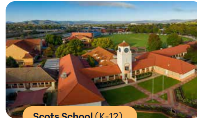
Scots School (K-12)

Families in the region have access to a full education pathway from early learning through to tertiary.