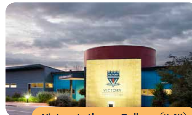
Victory Lutheran College (K-12)

Trinity Anglican College in Thurgoona delivers a comprehensive K-12 education within a connected school community, offering strong academic, sporting and co-curricular opportunities.