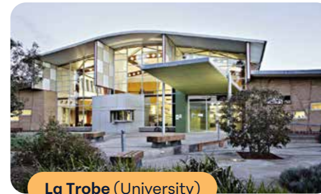
La Trobe (University)

Scots School Albury provides a well-established independent education pathway from early learning through to Year 12, with a strong focus on academic development, sport, leadership and student wellbeing.