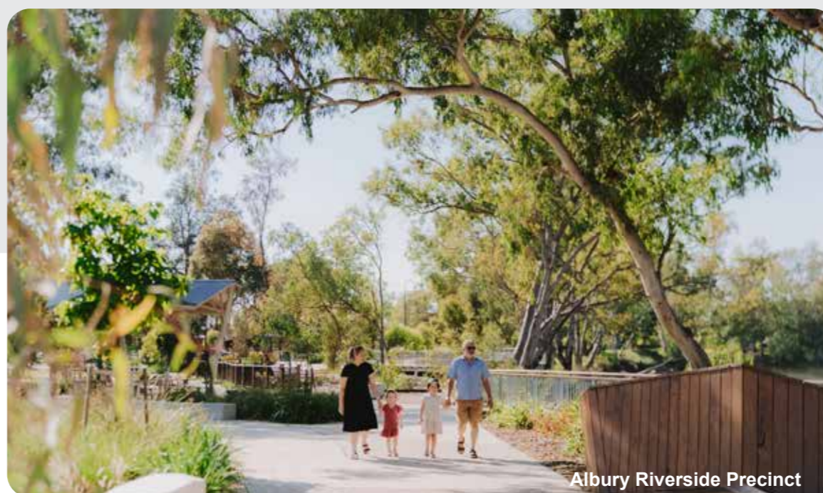
Albury Riverside Precinct