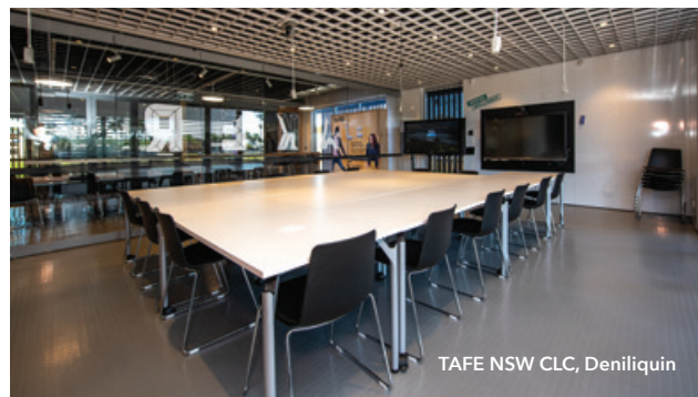
TAFE NSW CLC, Deniliquin