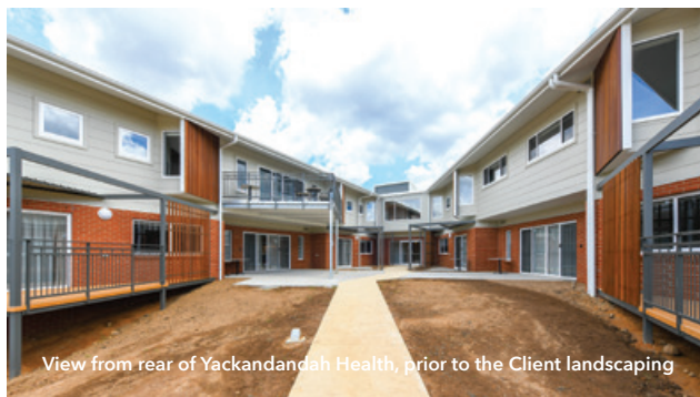
View from rear of Yackandandah Health, prior to the Client landscaping

Works were completed to the complete satisfaction of both the Superintendent and Client.