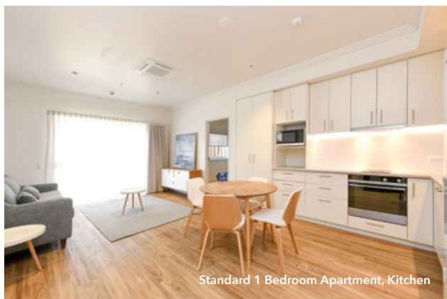
Standard 1 Bedroom Apartment, Kitchen