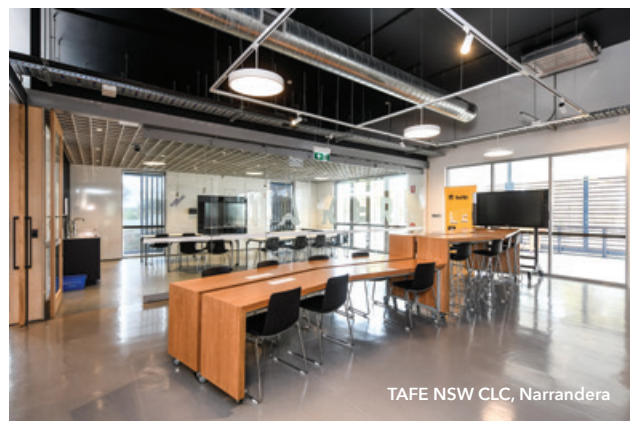
TAFE NSW CLC, Narrandera