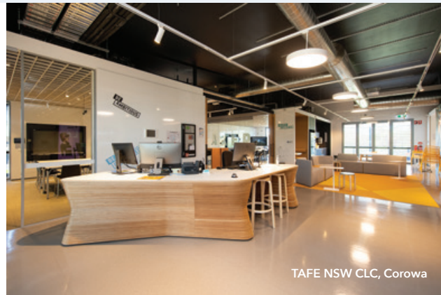
TAFE NSW CLC, Corowa