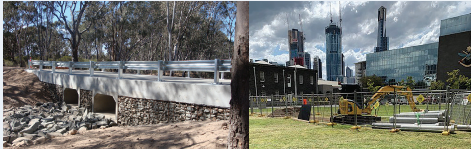
Ranges Civil Works Puckapunyal & Graytown. G70 Bridge construction of new 110T limit gabion bridge.