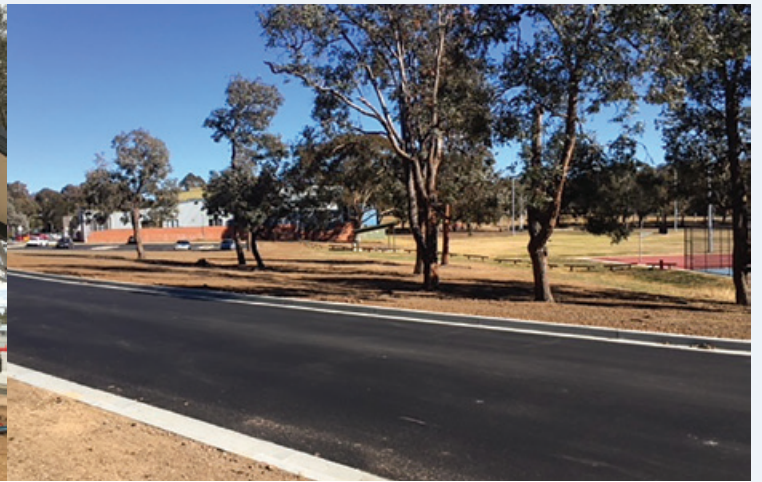
CSU Bathurst Roads and Carpark. Construction of Village Drive and Gymnasium Carpark, Stormwater Infrastructure works.