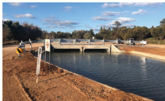
MAIN IMAGE TOP OF PAGE: Indoor Sports Stadium - Myrtleford RIGHT (TOP IMAGE): Indoor Sports Stadium - Myrtleford RIGHT: Murrumbidgee Irrigation Works - Griffith