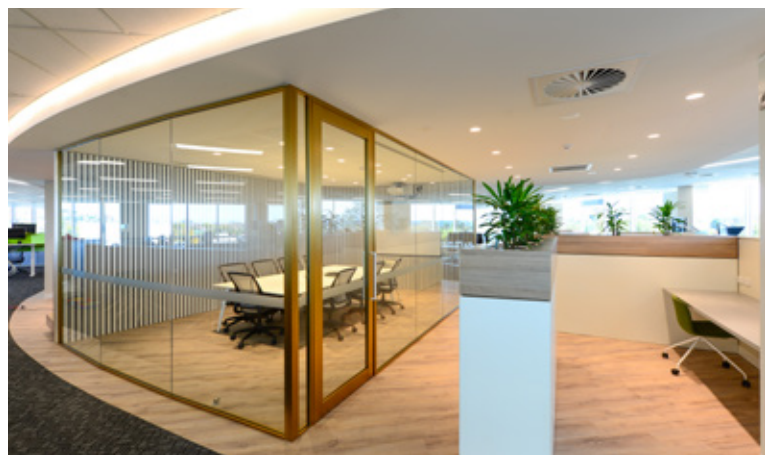
Roads & Maritime Service, Wagga Wagga