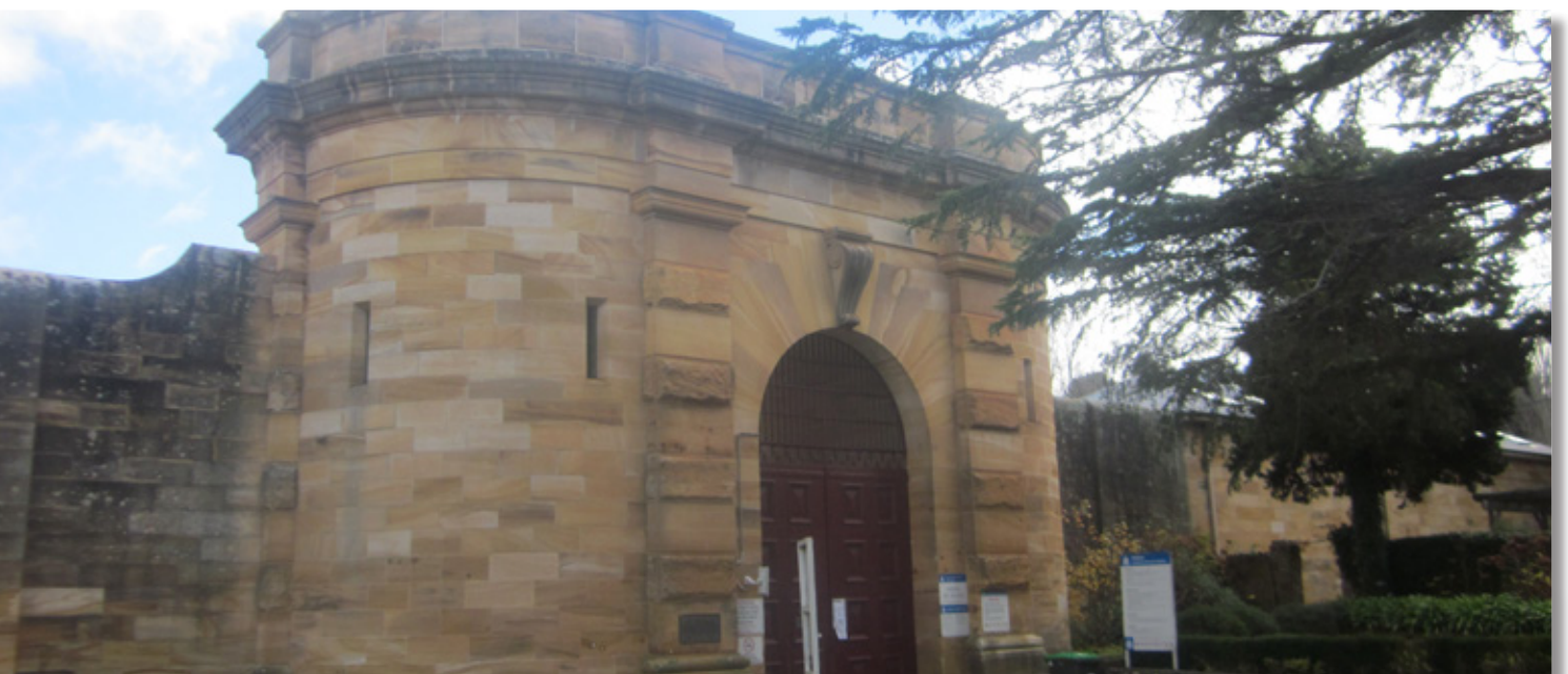
Works at Berrima Gaol were the refurbishment of the facility to become operational after being closed for a number of years. Works at the gaol included hydraulic services, electrical services, painting throughout and an upgrade of the facility security system.

Another exciting opportunity came to fruition in February with the success of the Facility Management Service contract at the recently constructed Coombs P-6 School in the ACT. This project was a joint submission in conjunction with Joss' Construction Division who successfully completed the design and construction of the new school. Joss Facility Management will maintain this site under contract for a period of five years.